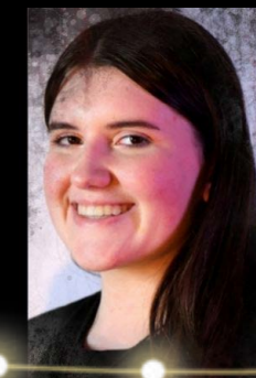
Gingerlily Fawke Ensemble