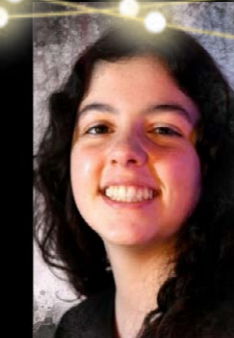
Michailia Lyri Ensemble