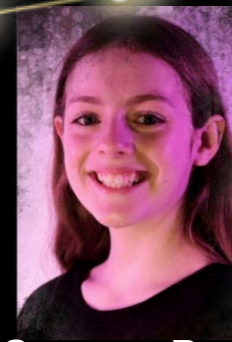
Summer Bush Music Captain / Vocals / Ensemble