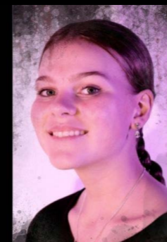
Cassandra Dell Ensemble / Production Crew